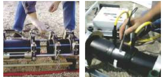
Recommended values for the heated tool butt-welding of pipes and fittings